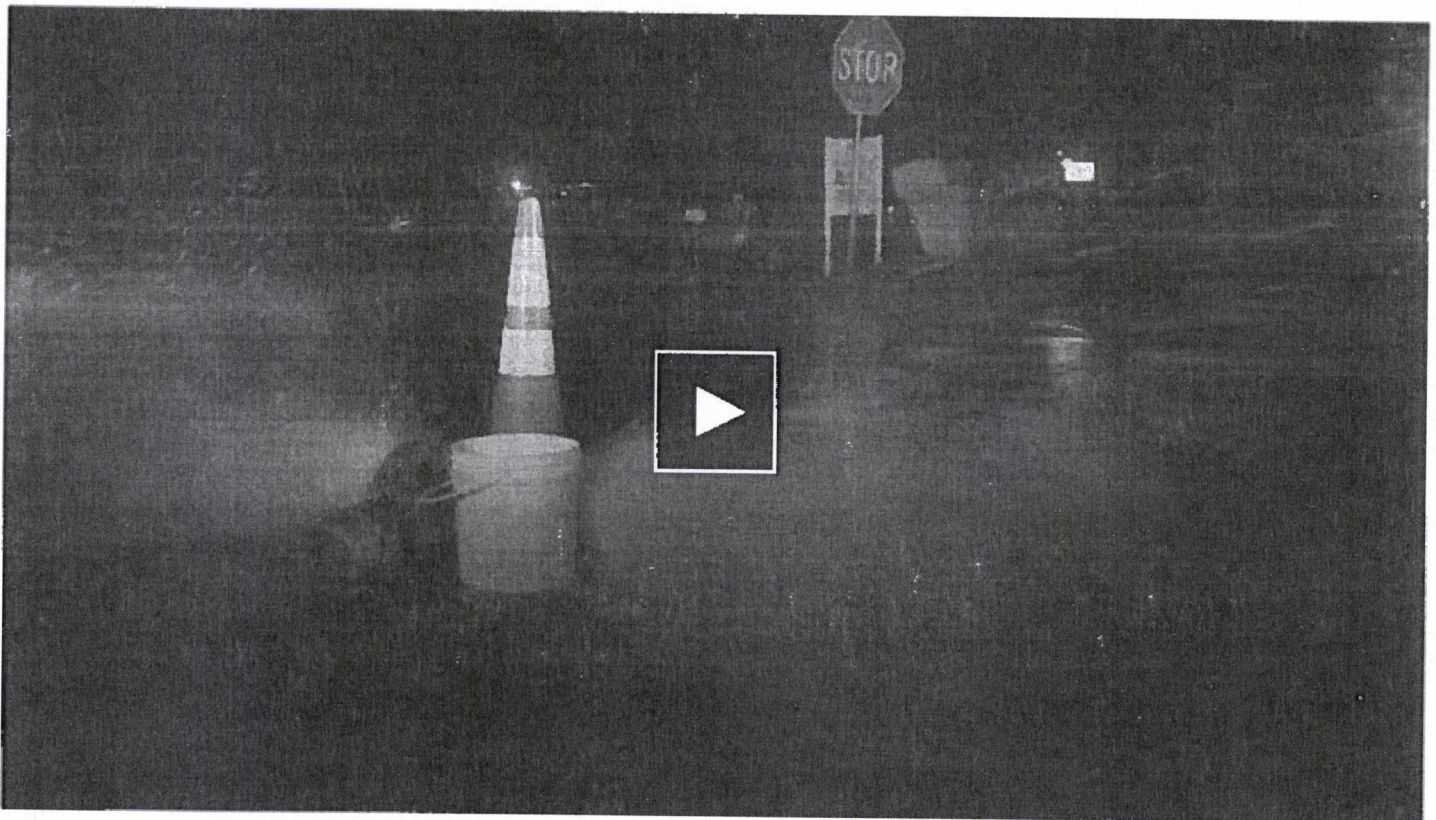
Testing on the materials in this new filter will begin in a couple days.